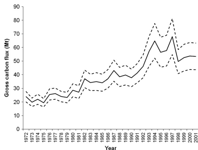
Fig. 2. PNG gross annual carbon flux from deforestation and degradation (Mt) 1972–2002. The solid line shows the best estimate, with the dashed lines above and below representing the upper and lower estimate respectively.

Our results suggest that while it is possible to generate a range of estimates for carbon storage (4142–5399 Mt, Table 2) and flux (966–1390 Mt between 1972 and 2002, Table 3) from a variety of source datasets, there remains a high degree of uncertainty regarding their actual value. Most of the uncertainty in our estimate of carbon stocks (Table 2) was associated with measurement of unlogged biomass, because the area of unlogged forest in 2002